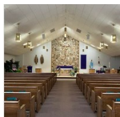
St. Mary's/Immaculate Conception Parish Florence | Florence WI